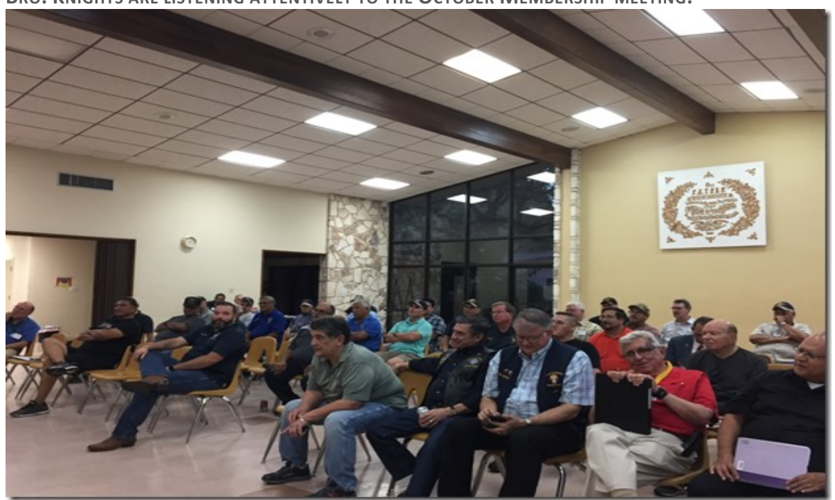
Bro. Knights are listening attentively to the October Membership meeting.